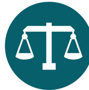
Firm but fair