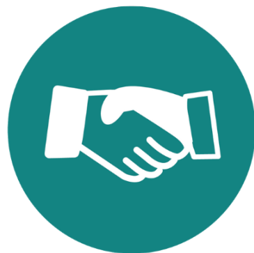
Open and honest